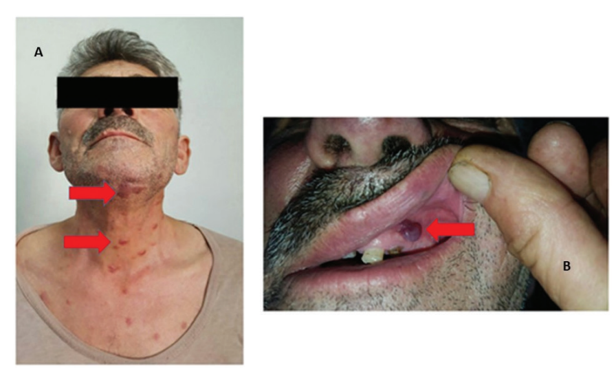
Figure 2. (A) Violaceous to erythematous patches and plaques, involving the face and neck, a common site in AIDS associated KS. (B) Asymptomatic Purple nodule in the gingiva, a less common presentation of classic KS (scale 40×).