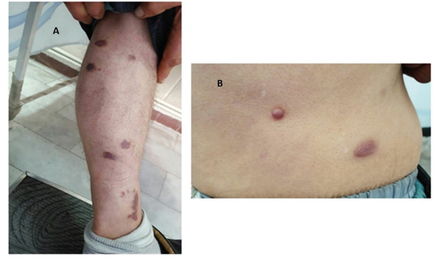
Figure 1. Well demarcated violaceous to brown plaques on the lower extremities and trunk.